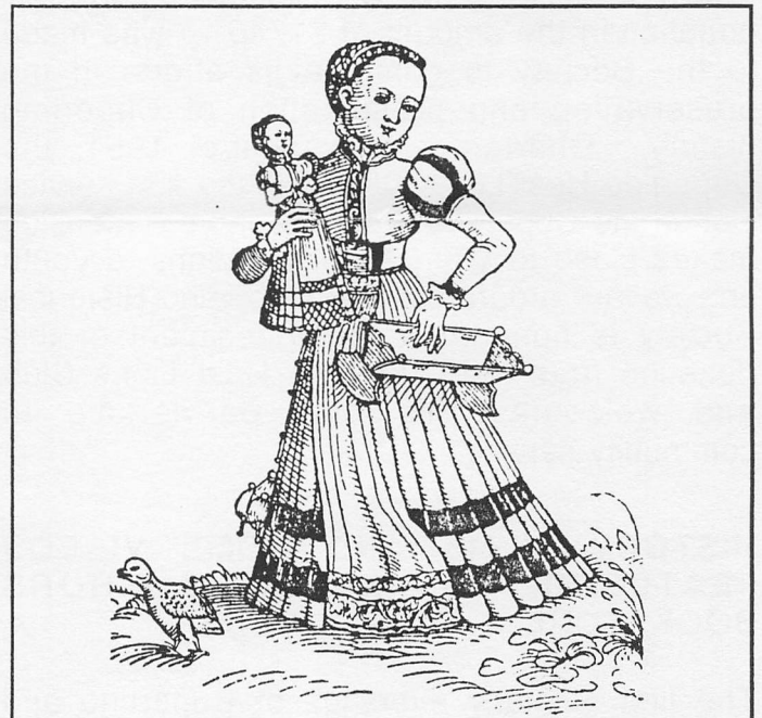
Woodcut of a girl with a doll and doll's cradle, dating from about 1540. Reproduced from Antonia Fraser's A History of Toys , c. 1966.